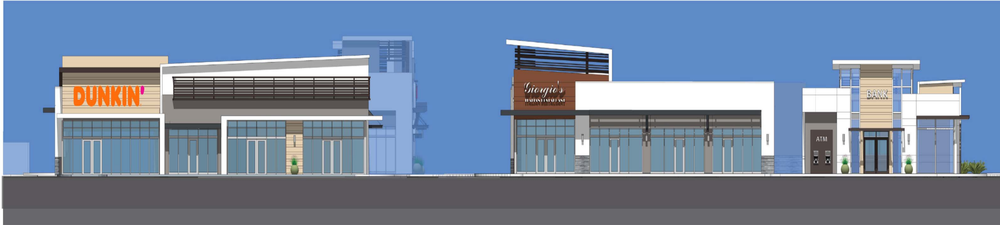
North Elevation (Building E,C, and Bank)

New Doral shopping center located across the street from Trump National Doral Club.